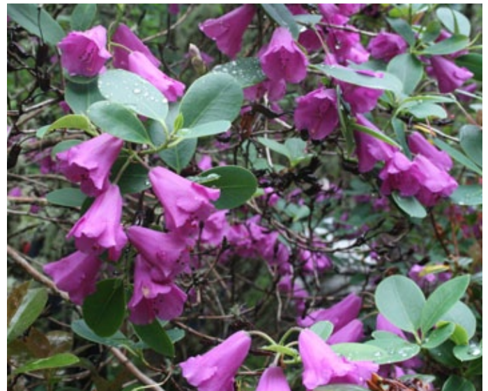
R. cinnabarinum ssp. tamaense at Arnuaine