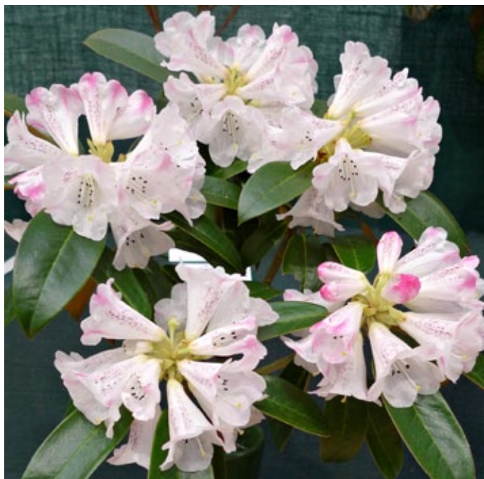
R. faberi in Class 2, above.