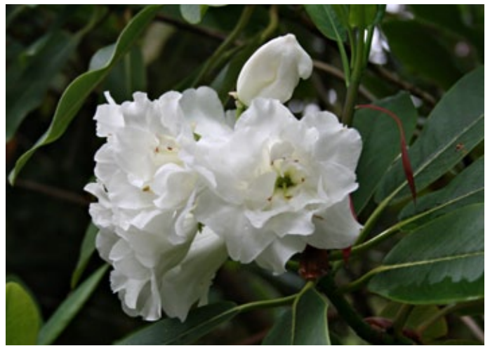
R. griffithianum Double Form

He also made interesting comments on cultivation, particularly referring to the heavy local annual rainfall of 65 inches or so. For planting, no holes are dug, but rather any surface grass is scraped away, and plants are placed in this scrape with a generous supply of leafmould, supported by incorporating rotting logs, matured in the damp woodland over five years before use.