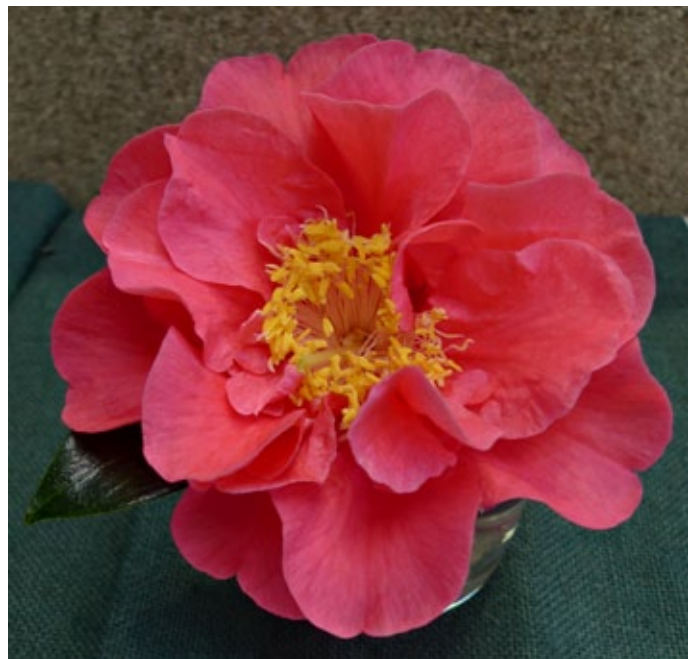
C. 'Francie L'. Entered by Chatsworth (Class 21, below)