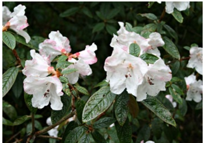
R. edgeworthii . Growing to perfection at Baravalla