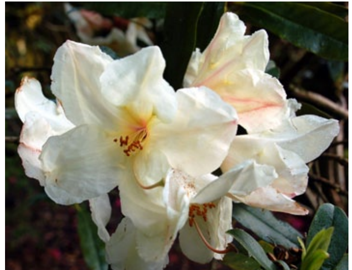
The massive bloom of R. maddenii Polyandrum group at Achamore Gardens

As an additional implication of this merger it will be necessary for the plant committee functions pertaining to Magnolias to be transferred to the new committee. This will form part of the