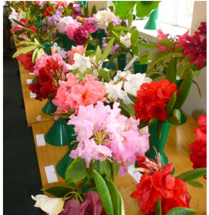
Part of the display of late flowering rhododendrons

This enjoyable event will hopefully be arranged again next year. Details should be available in a future Bulletin.